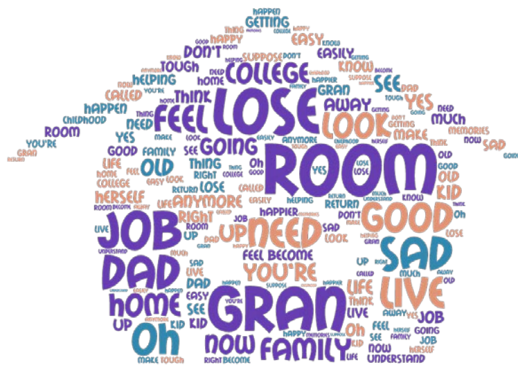
Diagramme 1: No Room for Gran

Tagul; import the words; edit the generated word list to take out UTF-8 errors; select the design and colour space of the word cloud; let the software generate the output. The actual graphic potential is highly dependent on the software, so I would encourage you to try out a number of sites. I choose Tagul because it allows