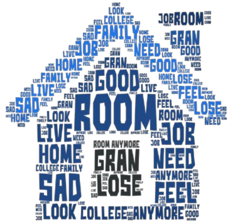
Diagramme 2: Revised

June: You're good. You'll get a job easily.